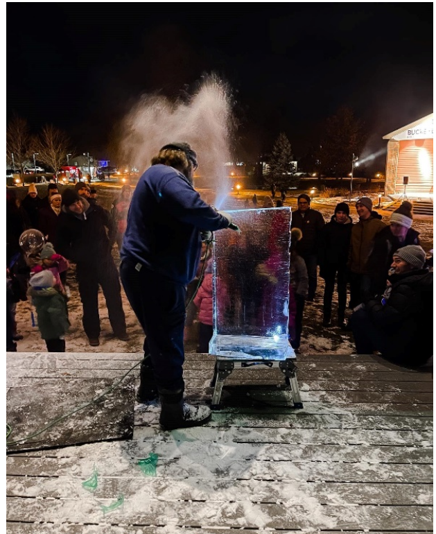
The ice sculptor begins his work at the Fire and Ice celebration.

❖ In January, there were nine calls with CIT dispositions. ♦