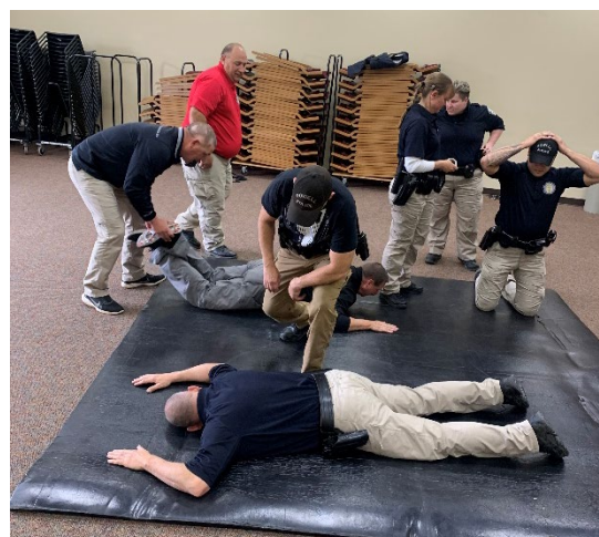
Defensive Tactics Training

In April the department conducted 233.35 hours of total training to include Continuing Professional Training covering eight topics (67 hours total for the agency), NIMS Training, Legal Updates, Fake Money Training, Naloxone/Narcan Training, Firearms/Defensive Tactics, Recruitment, Therapy K9, and Mountain Bike School Refresher. ♦