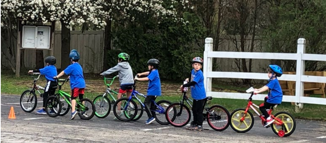
Boy Scout Bike Rodeo