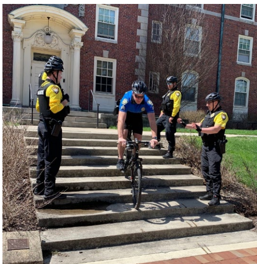
Mountain Bike School