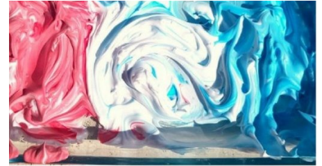
RED WHITE & BLUE shaving cream sensory play

I recommend staying away from using anything you use to cook or eat with when doing craft projects.