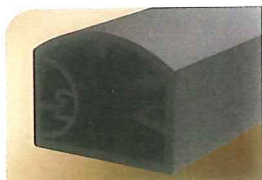
Top Rail Profile

NOTE: Baluster end spacing may vary by length. All sections do not come out even on each end as shown above.