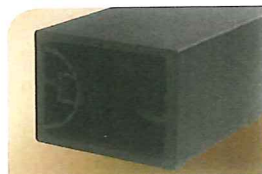
Bottom Rail Profile

A stylish 1-3/4" x 1-3/8" top rail combined with the 1-3/4" x 1-1/4" classic bottom rail creates a streamlined design sure to appeal to those with a touch of class.