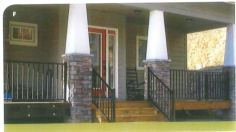
E Style: C10 With Level Crossover Post Color: Bronze Fine Texture