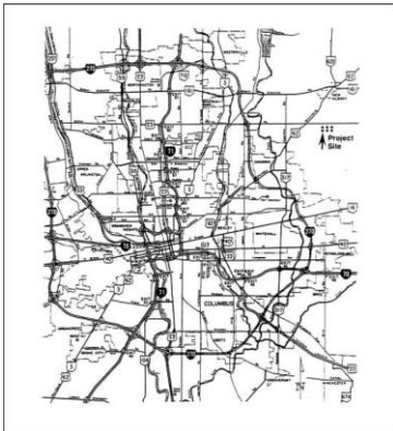
Example: Site Location Map