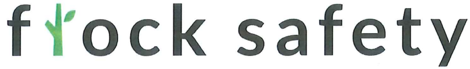
EXHIBIT A ORDER FORM

Customer: OH - Powell PD Legal Entity Name: OH - Powell PD Accounts Payable Email: Address: 47 Hall St Powell, Ohio 43065