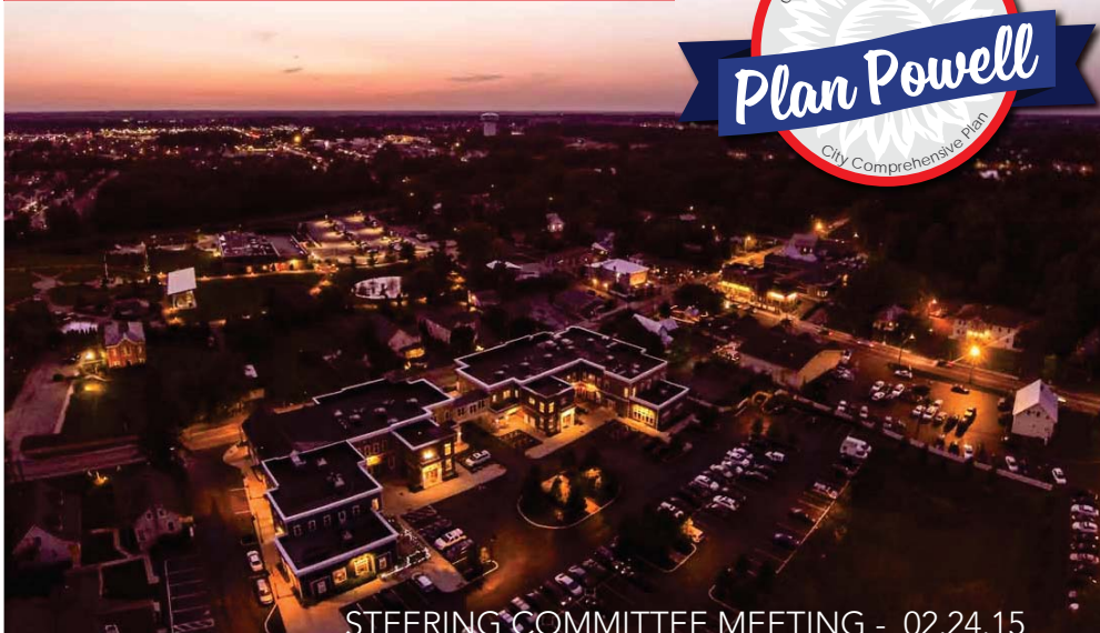
STEERING COMMITTEE MEETING - 02.24.15